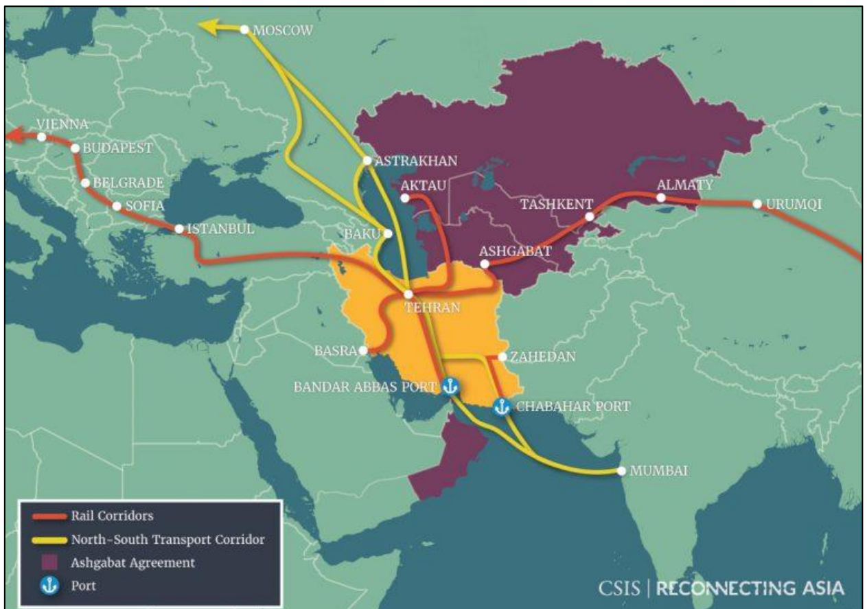
Figure 4. An iranocentric vision of the crossroads between the INSTC corridor and the OBOR initiative. Source: Saket. "India signs Ashgabat Agreement; trade and commerce to gain", 5 February 2018 https://www.theindianwire.com/world/india-signs-ashgabat-agreement-trade-commerce-gain-46692/ Consulted on 20/10/2020.

Iran is interested in a balance of power in the Caucasus to maintain the North-South corridor project, which would link Russia with Iran and India (known as the INSTC project) 27 . If Russia were to opt for either Armenians or Azeris, the result for Iran would be that it would be disconnected from the corridor that links it to Russia and that the Caucasian state that left the Russian orbit would enter NATO's orbit, forming a threat to Iran from the north.