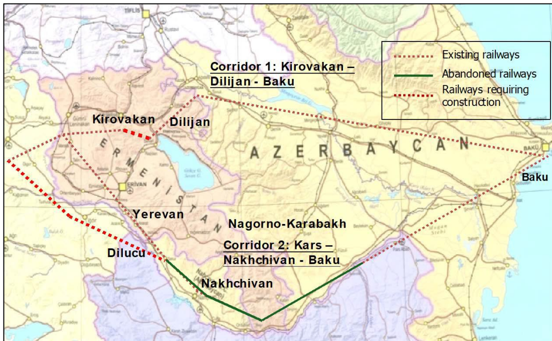
Figure 3. OBOR initiative to shorten Georgia's route.

its investments in Azerbaijan. At the same time, Armenia's position would provide it with alternatives to other trade routes 20 .