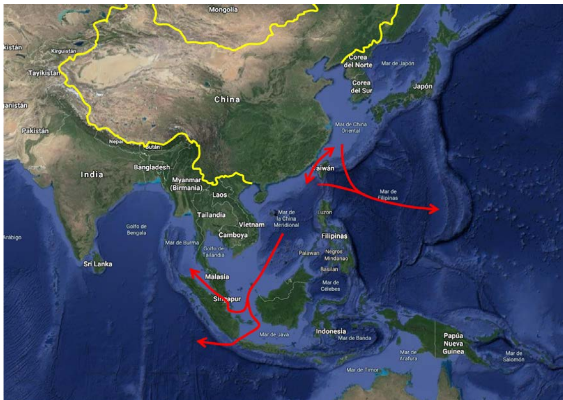
Figure 2: China's geostrategy for access to the Indian and Pacific Oceans

In 1989, the Tiananmen crisis became the first major setback. The PLA intervened against the demonstrators, damaging their image both inside and outside their borders. Since then, China has suffered a rigorous arms embargo from the Western powers. The survival of the regime and the fear of foreign interference reinforced its strategic priority.