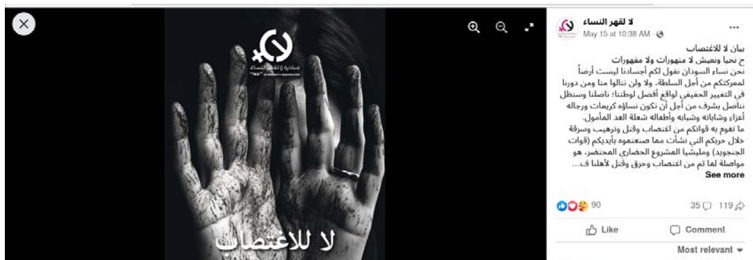
Figure 2. Facebook page of the No Oppression Against Women Initiative. Publication entitled "Say no to rape".

Since the 25 October coup, Sudan's security services have been hunting down political activists and civil society leaders. These arrests are aimed at curbing the activities of opponents of the coup and impeding the popular movement demanding the removal of the military from political power. 40