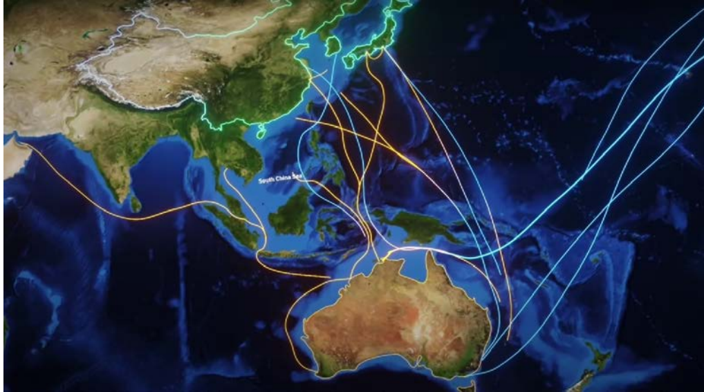
Figure 1. Australian maritime trade routes

Moreover, as a nation that arose from immigration by Europeans, mainly by the English and Irish, which marginalised the indigenous population in the process, and is surrounded by very different civilisations, Australia's Western identity is a determining factor.