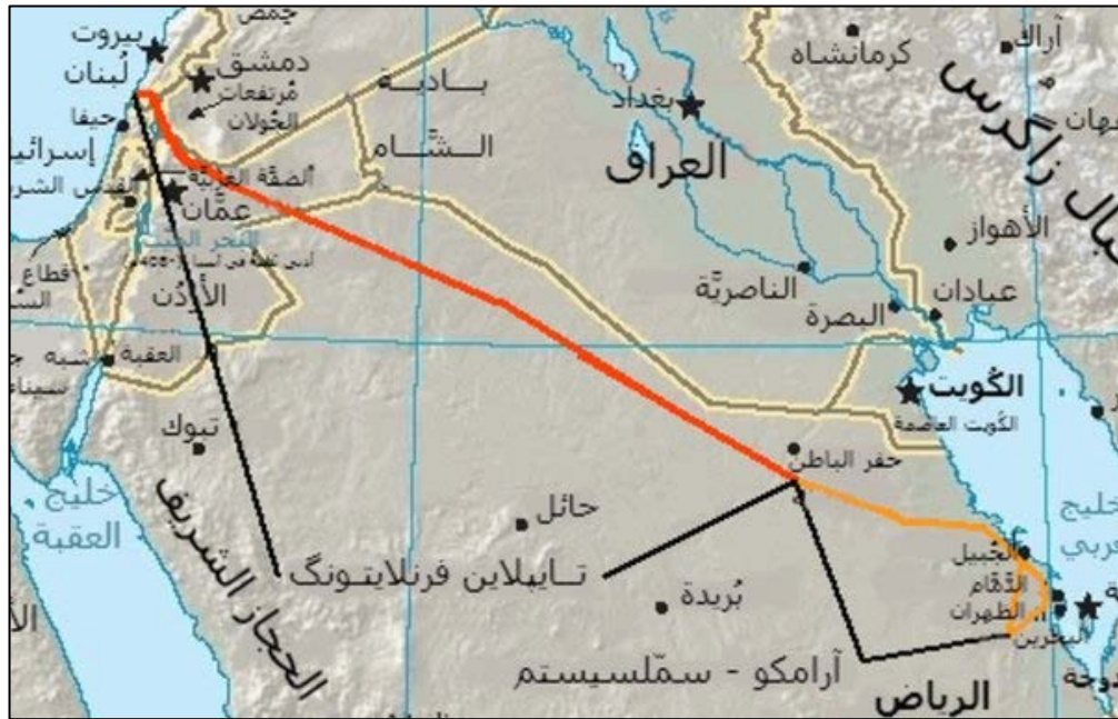
Figure 2. Map of the road running parallel to TAPLINE route

Peninsula with Lebanon, Syria and Jordan. The road was used for freight traffic and the main section, which runs through Saudi Arabia, is called "Highway 85" 10 .