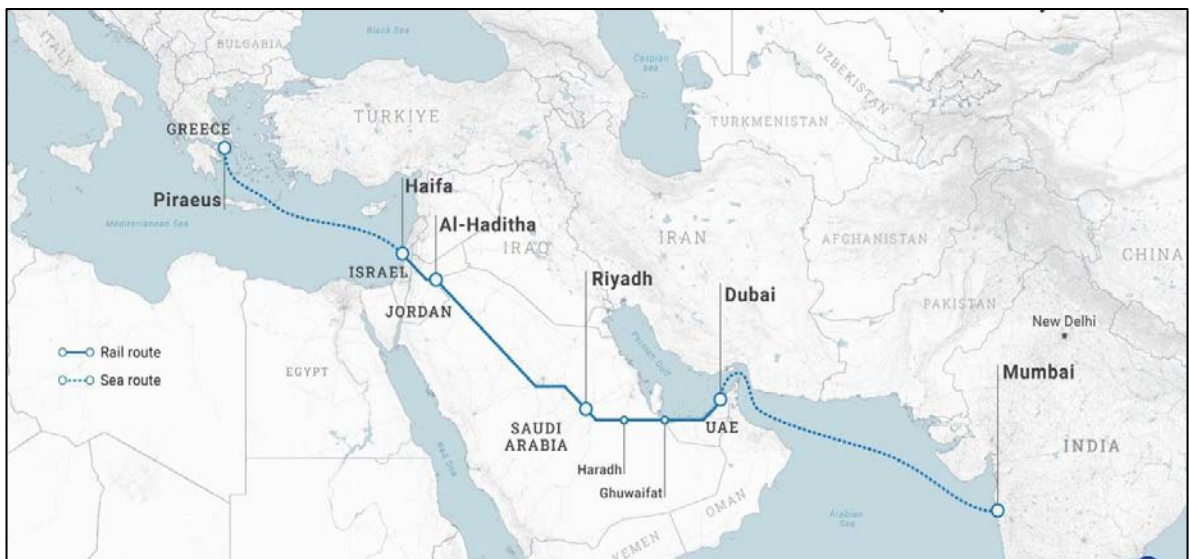
Figure 4. India-Middle East-Europe Economic Corridor Project (IMEC)

In parallel to the evolving dynamics of the area, an event that attracted global attention took place during the G20 Summit in New Delhi in early September 2023. India firmly expressed its position as a power in a new multilateral order by announcing, among other achievements, the launch of a communications corridor linking Indian and European ports via a land route through the Middle East 27 .