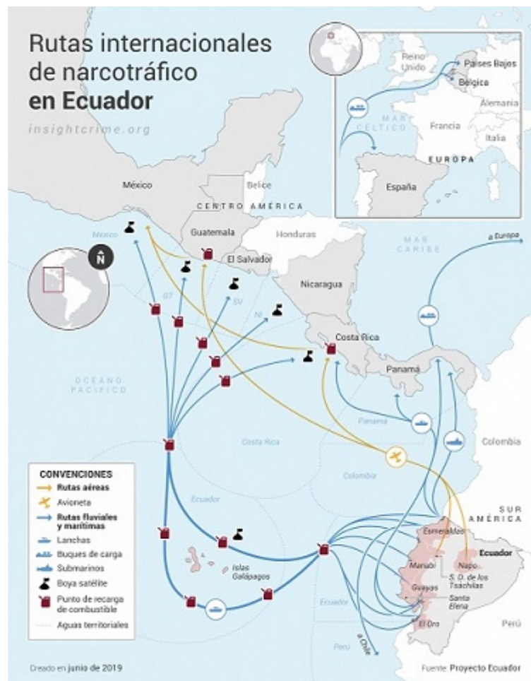
Figure 2. International drug trafficking routes in Ecuador.

This change in the regional dynamics of drug trafficking has contributed to the growth of the illicit drug trade in Ecuador, making it a major player in the international production and distribution chain. Drugs from neighbouring countries are channelled from Ecuadorian ports to destinations such as Guatemala or Mexico, where they undergo treatment processes before being shipped to the United States.