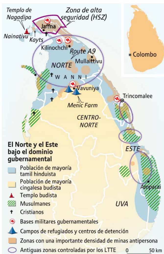
Figure 4: Distribution of Tamil-Majority Areas. 39

in Sri Lanka, for example, where a series of laws passed in 1956 sought to establish Sinhalese, which corresponds to the Sinhalese ethnic majority group in Sri Lanka, as the only official language of the country. The regions where ethnically Tamil groups and, consequently, the Tamil language, predominated responded with great outrage, and the subsequent unrest led to the elevation of Tamil to official status in the 1978 Constitution. In the following years, the Sri Lankan civil war began to take shape as the separatist group known as the Tamil Tigers surged forward. It would not end until the Tamil Tigers were defeated in 2009 38 .