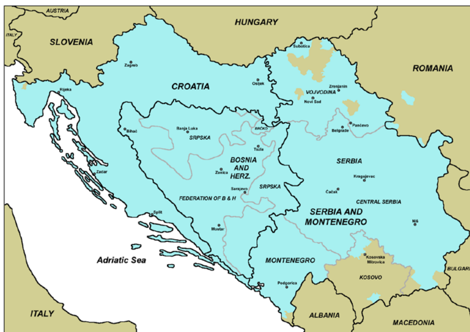
Figure 1: Areas in which the majority language is a variant of Serbo-Croatian

intense of which was applied to the Croatian language. Archaisms and neologisms were introduced, and intense purist tendencies emerged. In Serbia, where differentiation took a more moderate form, the new Constitution of 2006 established Cyrillic script as official, although until that time the Latin alphabet had been used at official and government levels. Lastly, Bosnian speakers have managed to differentiate their language from Serbian and Croatian by introducing loanwords of Turkish and Arabic origins 21 .