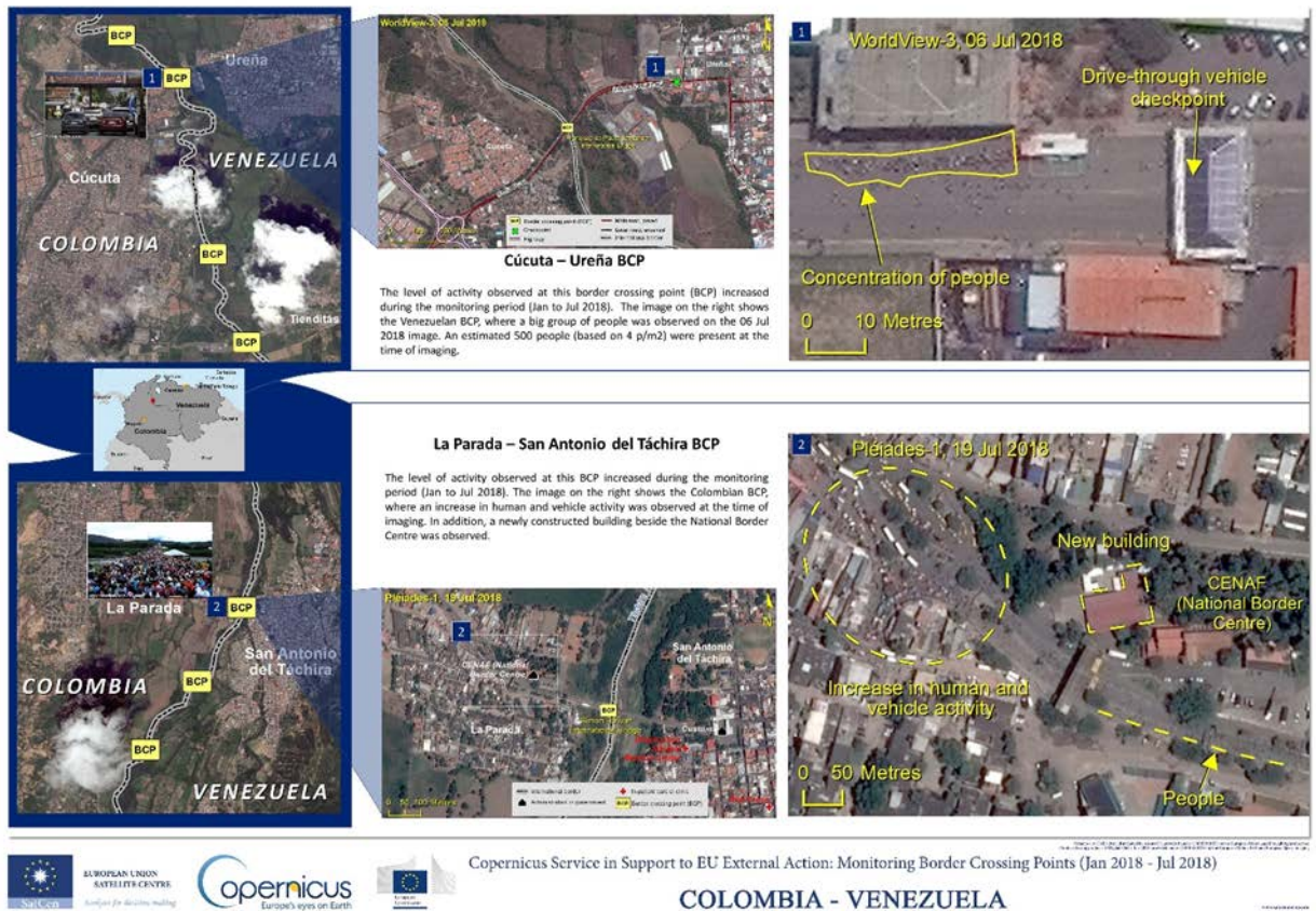
Figure 2. Monitoring Border Crossing Points between Colombia and Venezuela.

In this sense, it supports EU military operations, such as Operation ATALANTA or Operation IRINI (former Operation SOPHIA) to find out the position of smugglers and pirates. The Agency cooperation is fundamental to respond quickly, to avoid the commission of crimes and in critical situations, to save human lives.