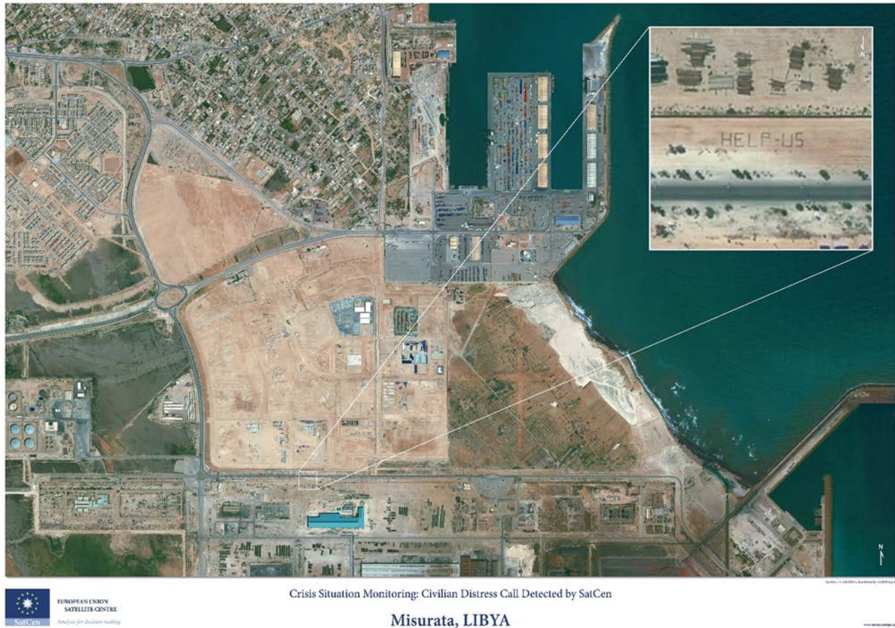
Figure 1. Crisis situation monitoring: Civilian Distress call detected in Misurata, Libya.

It can also help to identify the status of insurgent activity via the evolution of satellite photography, such as in the Arab spring, the jihadism or, nowadays, the Taliban rise to power in Afghanistan. Regarding the general crime and security surveillance issues, the Centre is involved in border control, the eradication of illegal trafficking, or the verification of compliance with treaties.