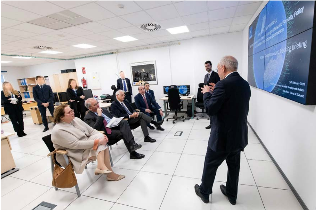
Figure 4. Visit by HR/VP Josep Borrell to the EU SST Front Desk, February 2020.

SST 'Front Desk', SatCen works closely with the Consortium and is the main contact point for the provision of three SST services: Collision avoidance, Re-Entry Analysis and Fragmentation Analysis.