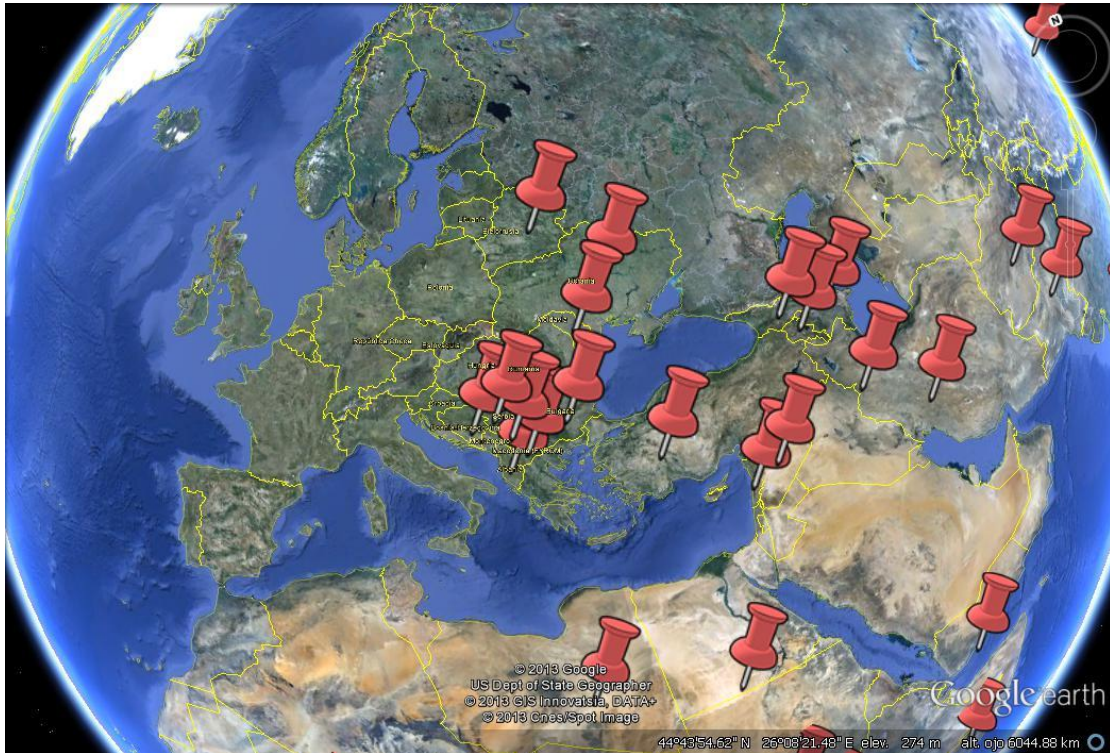
Figura 4: Puntos de conflicto en Europa (Elaboración propia)