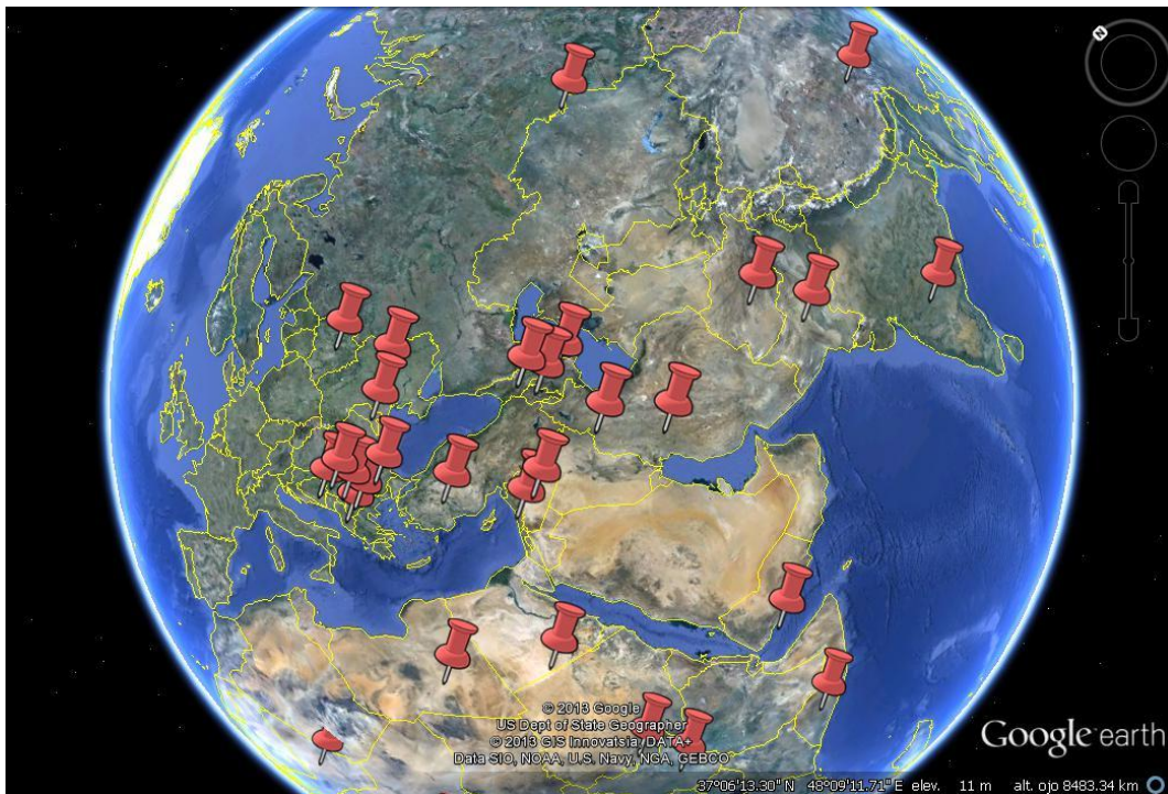
Figura 1: Puntos de conflicto en Oriente Medio y Norte de África (Elaboración propia)

Comienza este apartado del informe con referencias a la llamada “Primavera Árabe”, destacando la incertidumbre y violencia en lugares como Siria o Egipto, y la pérdida de apoyo popular a los gobiernos que accedieron al poder tras dichas revoluciones, lo que invita a próximas revueltas.