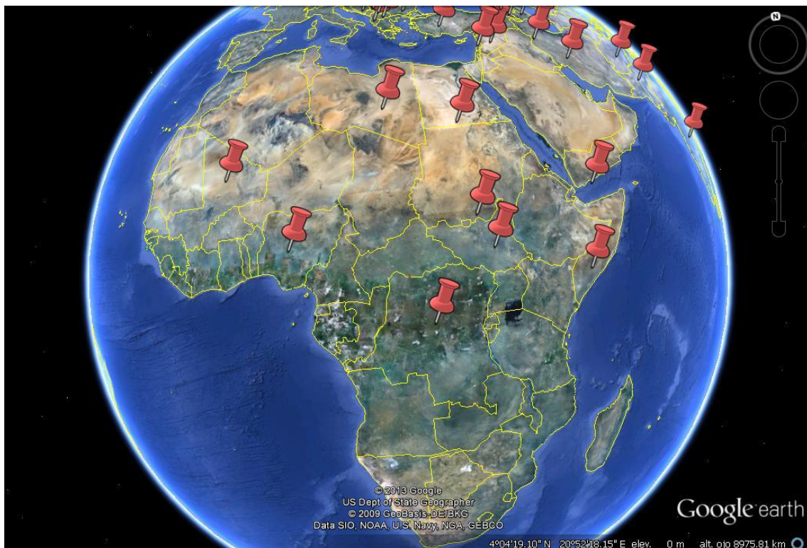
Figura 2: Puntos de conflicto en África (Elaboración propia)